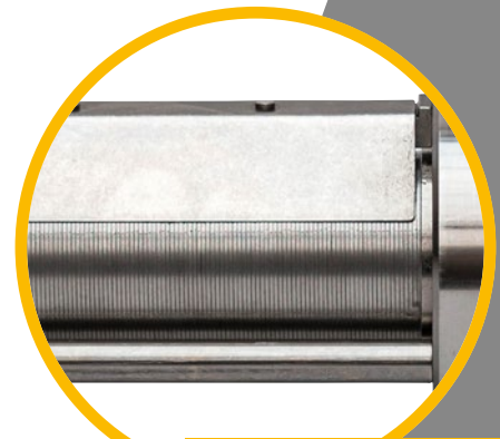
Gap-type tube filter insert