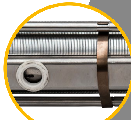
Profluid filter insert