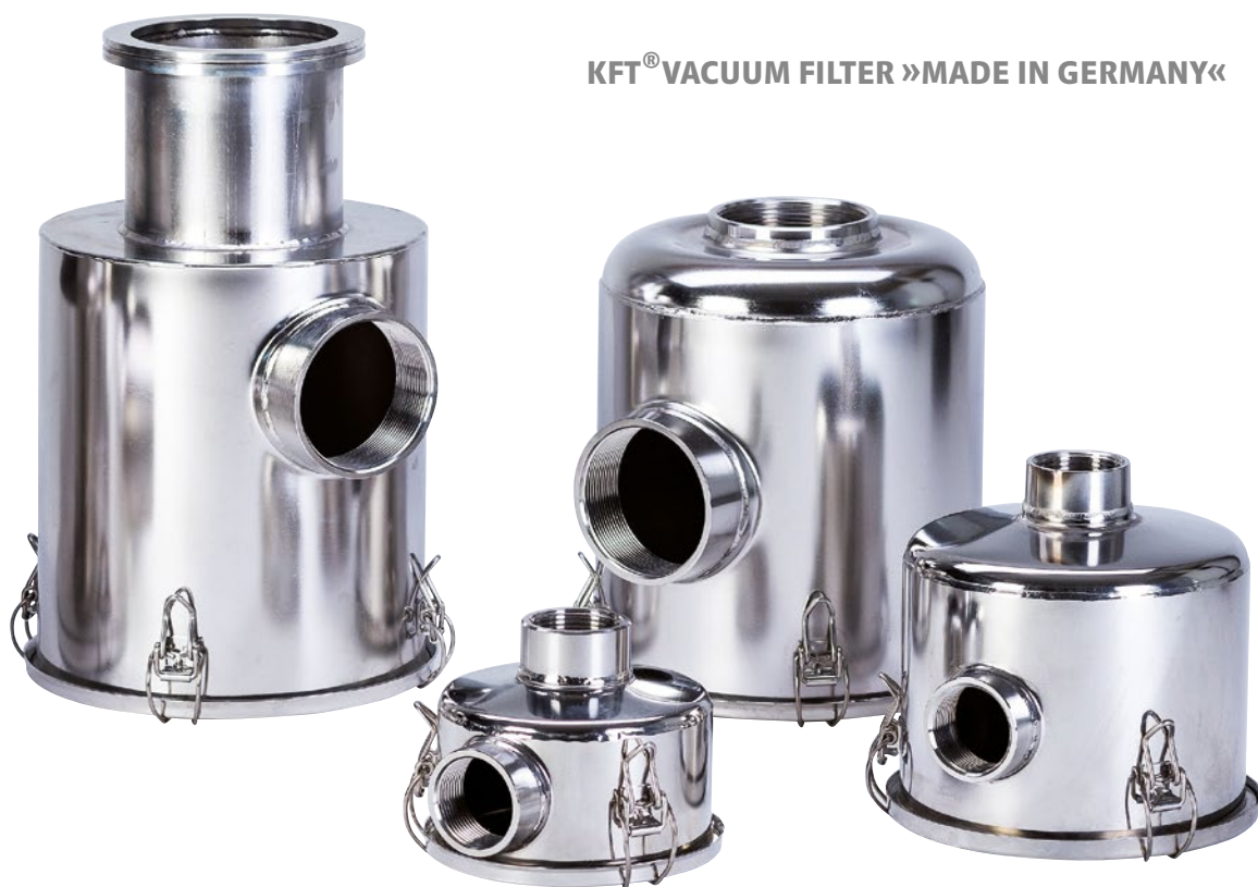
KFT® VACUUM FILTER »MADE IN GERMANY«