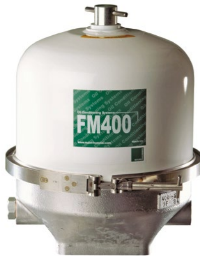
FM OIL CENTRIFUGE