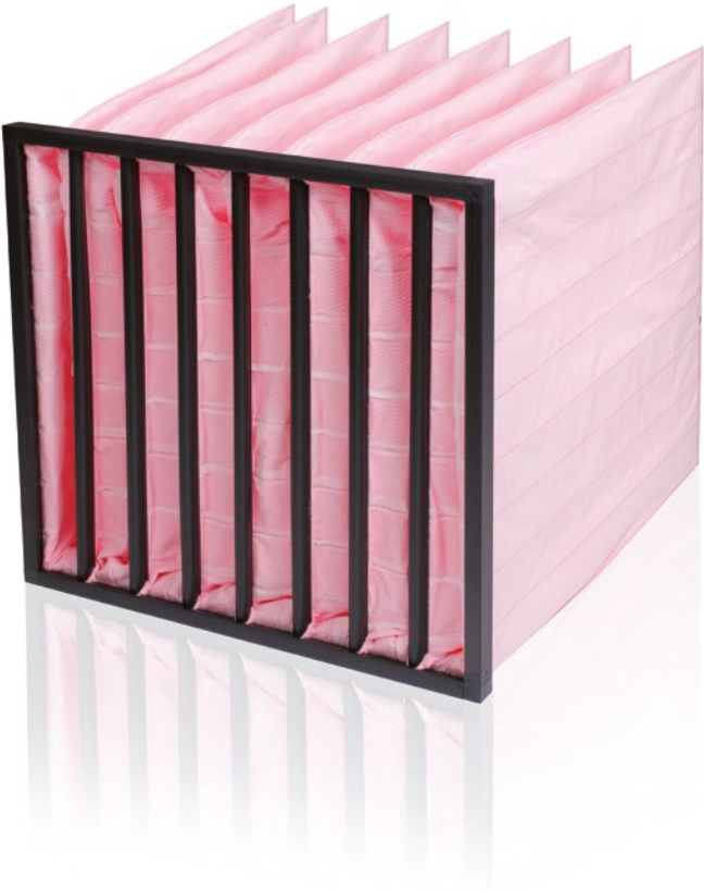
AIRCUBE PRO HT FINE DUST FILTER