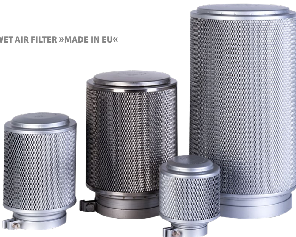
KFT® WET AIR FILTER »MADE IN EU«