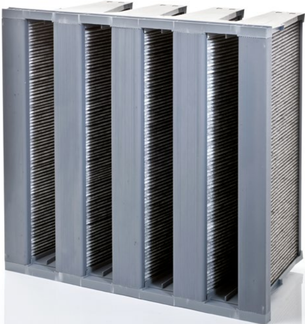
AFP PROCESS GAS FILTER