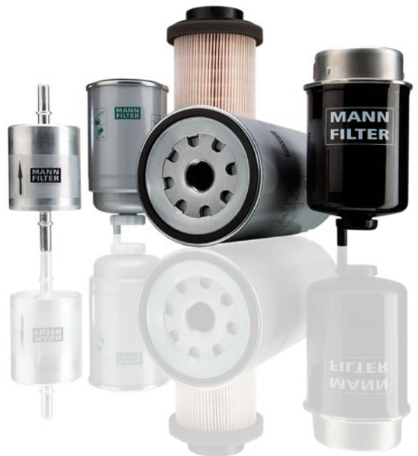
FUEL REPLACEMENT FILTER